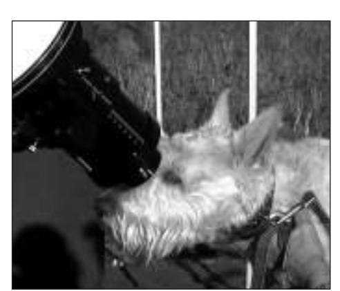
This pooch takes stargazing more serious than his master.

their tails. I even saw a recycle-minded one eating the cow doo-doo since we were meeting in a rancher's pasture.