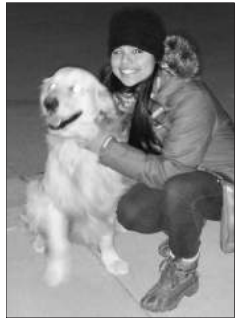
We found this visitor and it fit in like a regular.