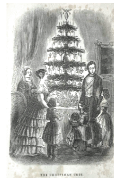
Osborne House Christmas Tree illustration in Godey's Lady's Book , December 1850

The first decorated tree was at Riga, Latvia, in 1510. In the early 16th century, Martin Luther is said to have decorated a small Christmas tree with candles to show his children how the stars twinkled through the dark. The early trees were biblically symbolic of the Paradise Tree in the Garden of Eden. The many food items were symbols of Plenty, the flowers—originally only red—of Knowledge, and White for Innocence!